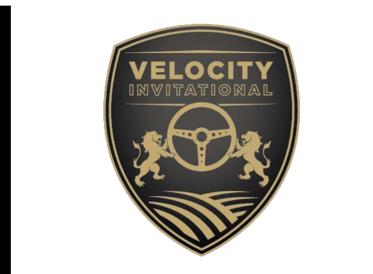
Web safe shield