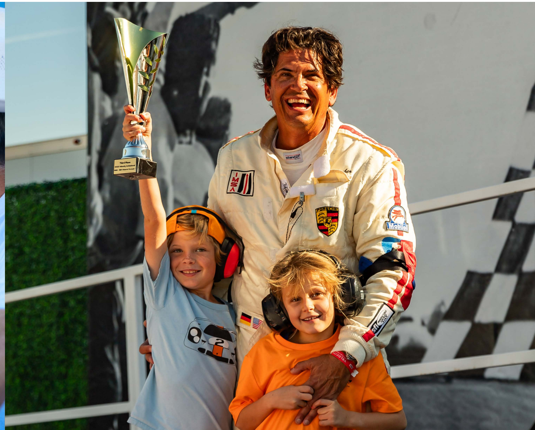
A celebration of sport.